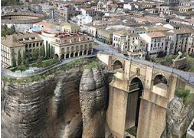
City of Ronda