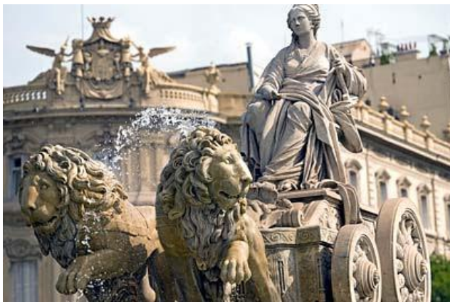
Madrid – Cibeles Fountain

After a hearty breakfast buffet, we will have a morning guided tour of Madrid that includes a full panoramic tour through the Avenida Mayor, Puerta del Sol, Plaza del Parlamento and a photo stop outside the Royal Palace.