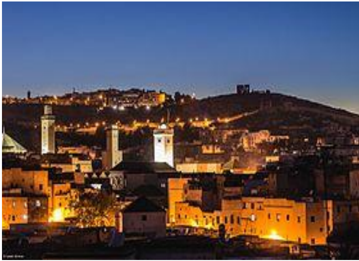
Fez- Medina Fez-el-Bali

Heritage Site with 785 mosques and more than 2,000 squares, streets and alleys that are an interesting labyrinthine. Going back in time from Bab Boujloud to Esseffarine Square we will take a journey through the centuries starting in the 9th to the 19th century. Along the walk we will learn how these alleys are structured, and the different constructions that make up the walls of the Medina, as well as its guilds of artisans and neighborhoods such as the leather tanners or seamstresses, to see their ancient ways of working. We will visit a medersa (school or center of studies in the Islamic world) and we will finish to the sound of the hammer of the potters working the copper as they did hundreds of years ago. Lunch (free) in a typical restaurant, inside the medina and free afternoon to explore the city. Dinner at our hotel. Overnight in Fez.