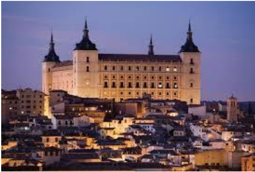
Toledo – Alcazar - Historical Fortress

Madrid is a city characterized by intense cultural and artistic activity and dates back to 882 BC and has museums and monuments of extraordinary beauty. In the afternoon, we will head to the city of Toledo , walking through the old Jewish quarter before visiting the Synagogue of Santa Maria la Blanca, the oldest synagogue in Europe still standing. Next up is the Church of Santo Tomé, with its magnificent masterpieces by El Greco. During the afternoon we return to Madrid. Farewell dinner at our hotel. Accommodation in Madrid.