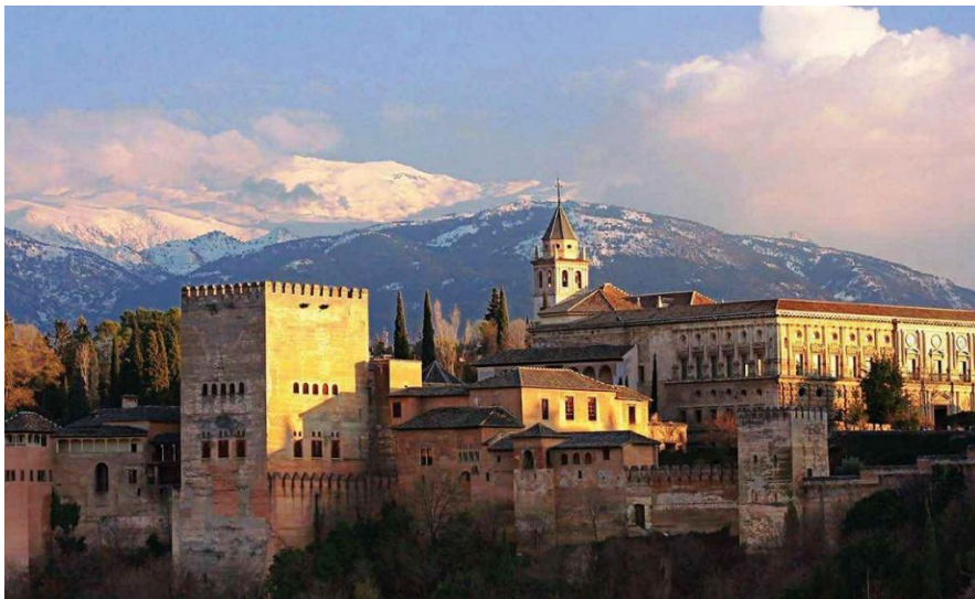
The Alhambra Palace in Granada

Tonight we have dinner with wine at our hotel. Overnight in Costa del Sol.