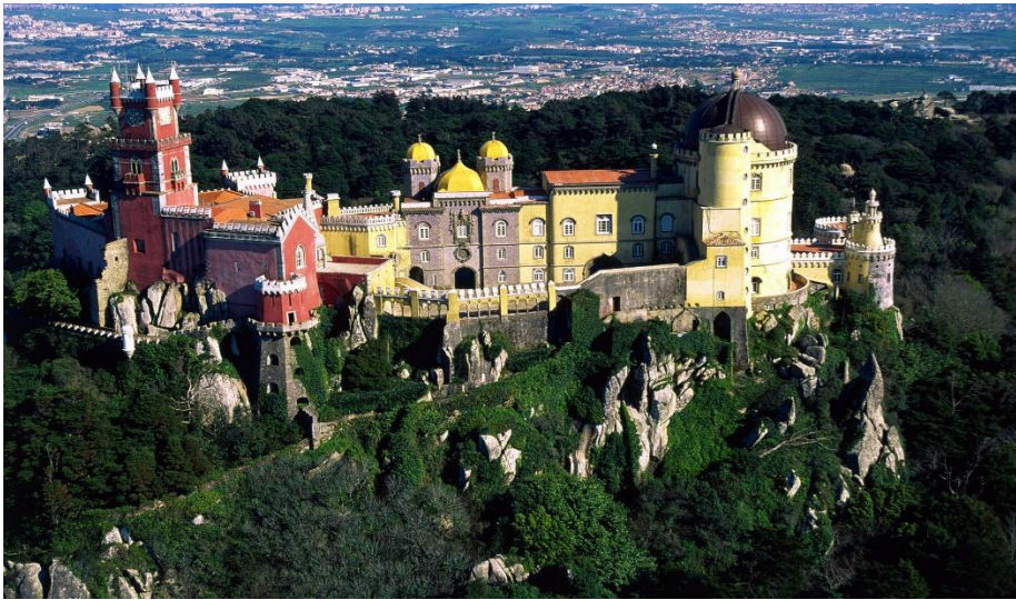
Pena Castle in Sintra