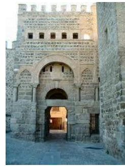
Ancient city door