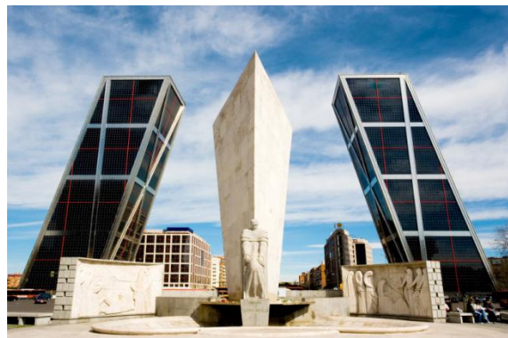
Madrid Financial District